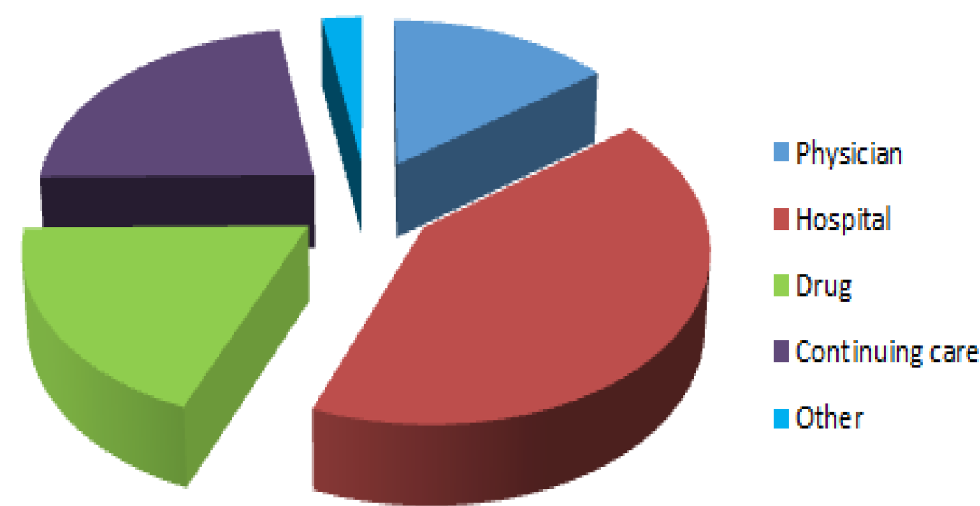
Figure 3: Mean cost by service type, number of conditions and age groups